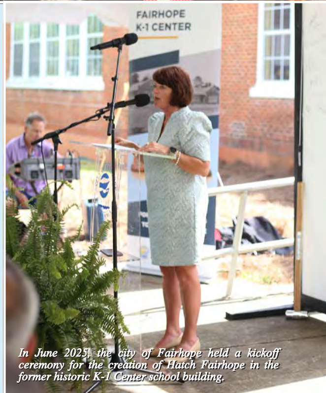
In June 2025, the city of Fairhope held a kickoff ceremony for the creation of Hatch Fairhope in the former historic K-1 Center school building.

Tree-lined streets, walkable neighborhoods and a vibrant downtown are not just features — they are intentional