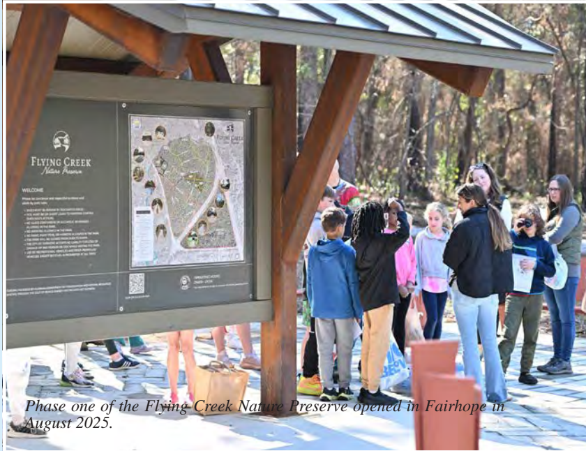
Phase one of the Flying Creek Nature Preserve opened in Fairhope in August 2025.

Scan the QR code for more information about the ACE Program.