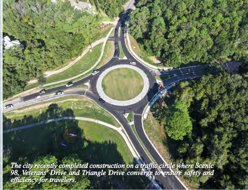
The city recently completed construction on a traffic circle where Scenic 98, Veterans Drive and Triangle Drive converge to ensure safety and efficiency for travelers.

From its origins as a small coastal settlement to its current role as an ACE community, Fairhope exemplifies what is possible when a city invests in itself, not just for today, but for generations to come. In doing so, Fairhope stands as a shining example of excellence along the shores of Mobile Bay, offering a blueprint for communities across Alabama seeking to build a better future. ■