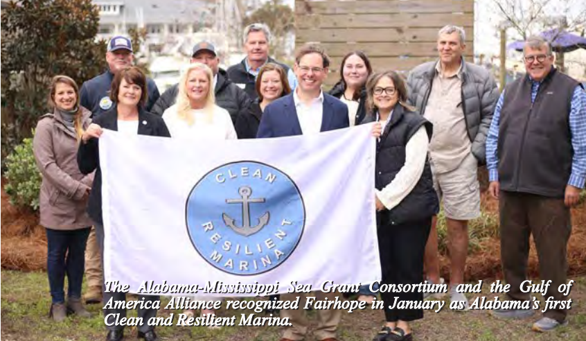
The Alabama-Mississippi Sea Grant Consortium and the Gulf of America Alliance recognized Fairhope in January as Alabama's first Clean and Resilient Marina.